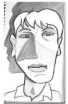
My cubist style portrait of Oprah